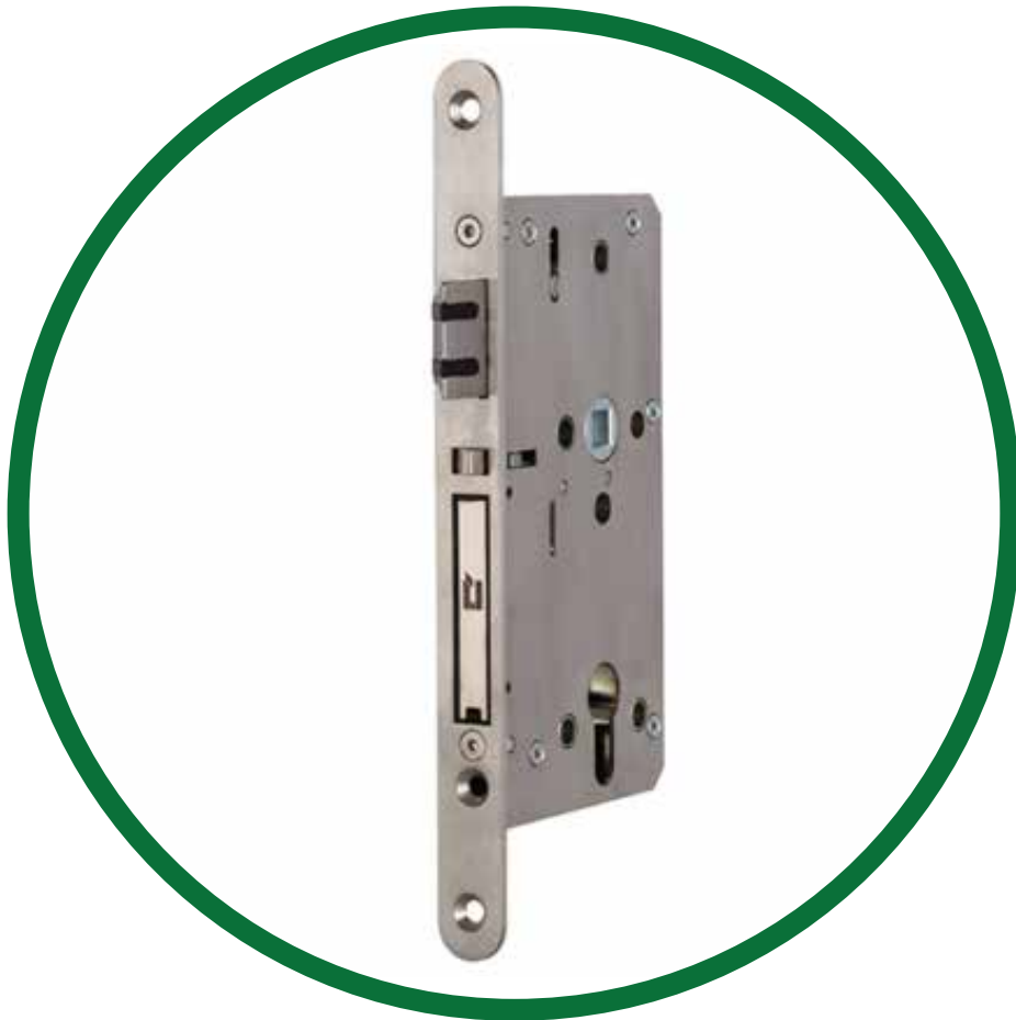
BATTERY OPERATED LOCK